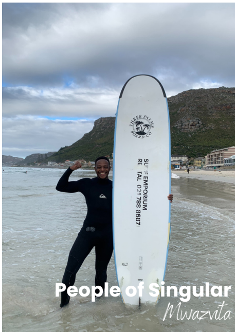
People of Singular Mwazvita