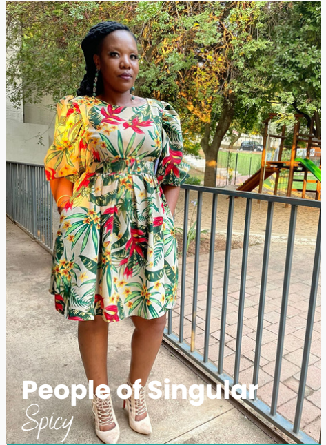
People of Singular Spicy