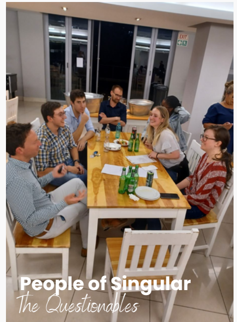
People of Singular The Questionables