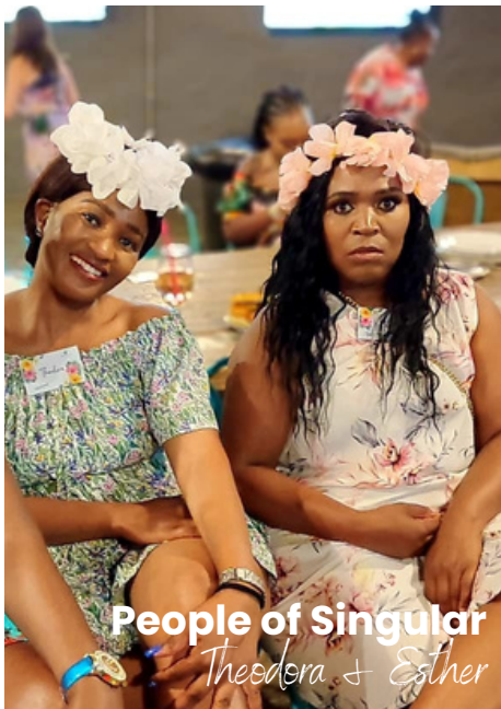
People of Singular Theodora & Esther

"The Bula Tsela scheme IPO is another perfect example of how the unbelievable team at Singular always pulls together for a common cause. We had staff from different divisions assist with document uploads, and the learners added huge value when the volumes escalated rapidly and without everyone's support, this would not have been the success it has turned out to be."